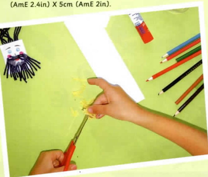
3. Use some wool to make hair.