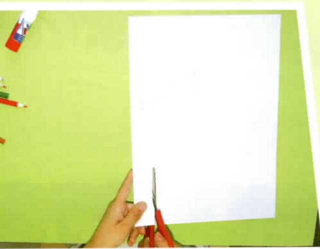
1. Cut 4 strips of paper. Each one should be about 6cm (AmE 2.4in) X 5cm (AmE 2in).