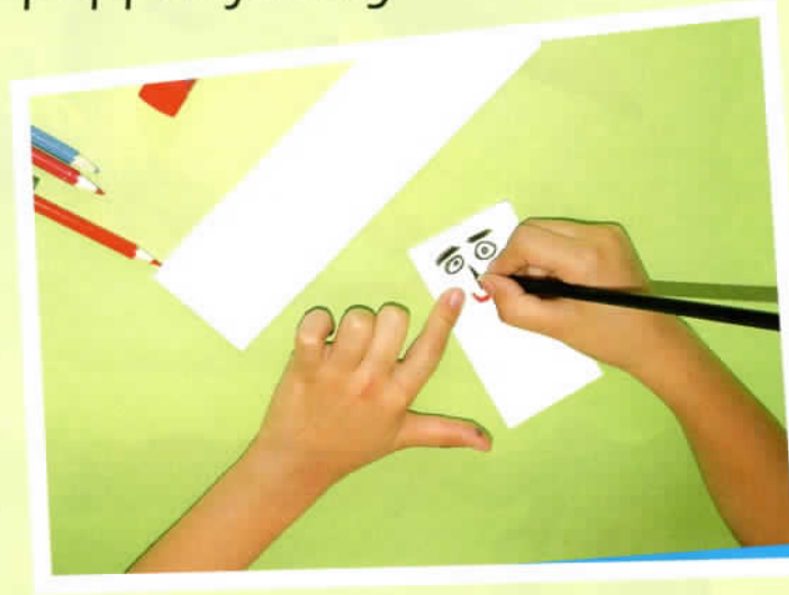
2. Draw faces on the strips of paper.