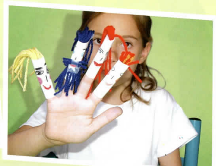
4. Tape the puppet family to your fingers and play!